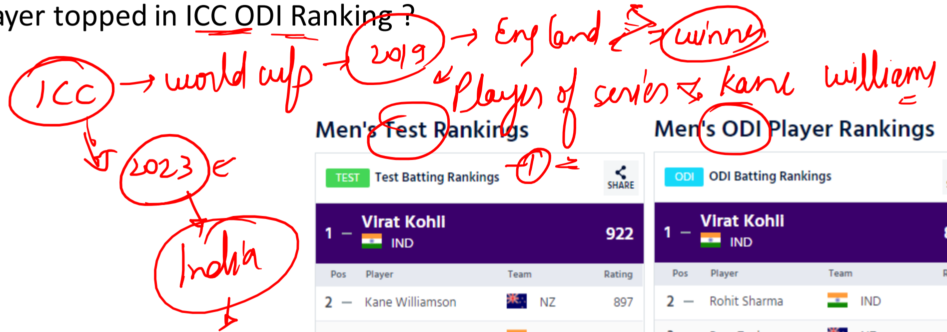
Men's Test Rankings