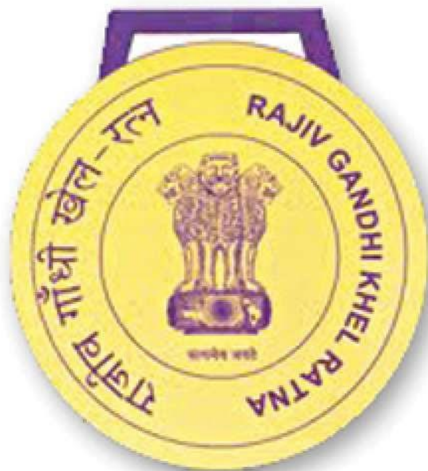
Rajiv Gandhi Khel Ratna