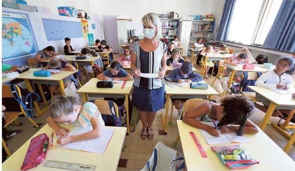
Back in classroom: A teacher, wearing a protective face mask, teaching in a classroom at a primary school in Nice after it reopened on Tuesday.

But many governments insist that the greater risk is young people losing out on