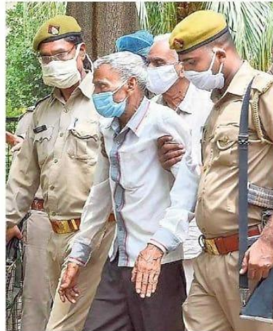
Police taking away those convicted in Mathura on Wednesday.