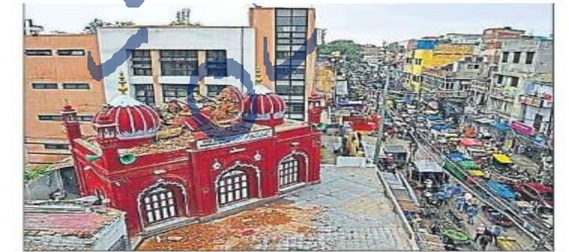
The dome of the Masjid Mubarak Begum, a historical mosque in Old Delhi, was damaged due to heavy rain on Sunday.