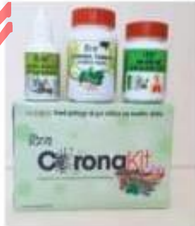
A photo of the kit released by Patanjali.

In a statement issued by the Ministry of Ayush on the claims made by Haridwar (Uttarakhand)-based Patanjali Ayurved in treating COVID-19, the Ministry noted that it had taken cognisance