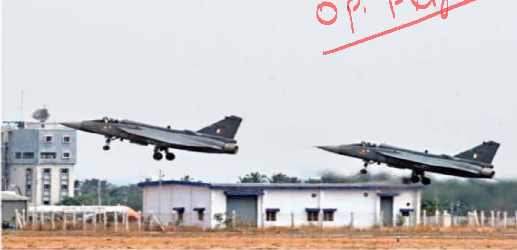
New recruits: Two Light Combat Aircraft Tejas Mk-1 do a flypast to mark their induction into Squadron 18 of the IAF at the Sulur base, near Coimbatore, on Wednesday. The combat aircraft was manufactured by HAL, Bengaluru.