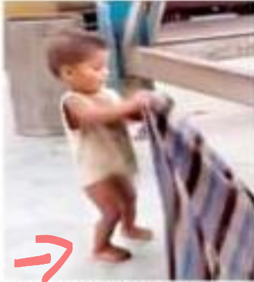
The video of the child went viral on social media.

An older child, with a water bottle in hand, too, appears for a moment in the video. "The woman had reached the Muzaffarpur railway station on May 25 along with her two children,