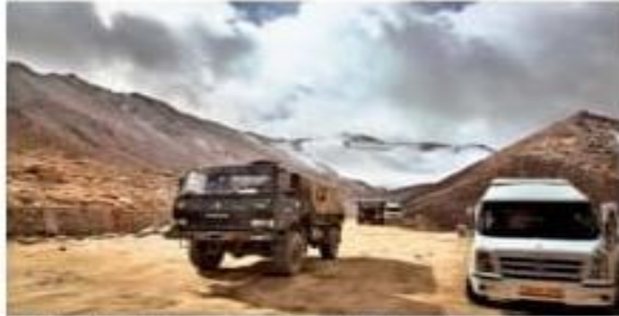
High stakes: An Army truck crossing Chang La near Pangong lake in Ladakh region in this file photo.

Indian and Chinese troops have faced off at at least four points along the LAC, including Pangong Tso (lake), Demchok and Galwan Valley in Ladakh and Naku La in Sikkim, where PLA soldiers are reported to have occupied tracts patrolled by Indian troops, pitching tents and