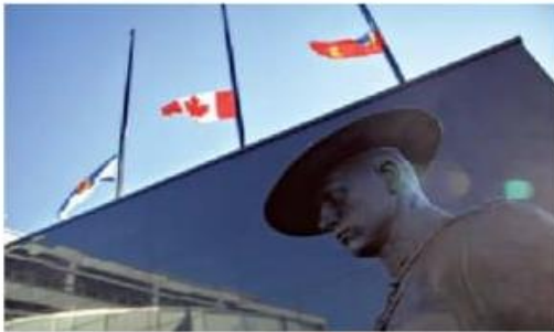
In tribute: Flags of Nova Scotia and Canada flying at half-staff outside police headquarters in Dartmouth on Monday.