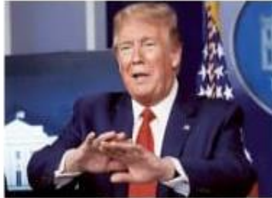
New measures: Donald Trump in Washington on Monday. >>>

Monday night's tweet on immigration could also be Mr. Trump's way of trying to push States to open up, after weeks of lockdown, a Washington DC source who works