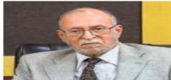
Anil Baijal ■

Delhi has been given the go-ahead to use plasma enrichment technique on a trial basis to save the lives of critical COVID-19 patients, Lieutenant Governor Anil Baijal was told at a review meeting on Wednesday.