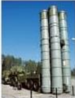
The firm is set to supply the S-400 air defence systems.

In the first such donation of its kind, Russia's State-owned defence exports company Rosoboronexport has committed $2million (₹15.3 crore) to the newly set up 'PM CARES Fund', diplomatic and government sources confirmed. The proposed donation to the fund that has been set up specially to assist the government's efforts in combating the COVID-19 pandemic, marks a significant shift in India's policy on accepting contributions from foreign government owned companies. Thus far, the government had been