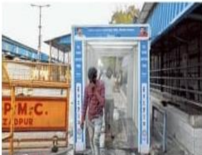
Tunnel vision: People passing through a sanitisation tunnel at Azadpur Mandi in New Delhi.