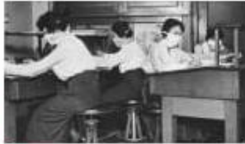
Past pandemics: Clerics at work at an office in New York during the Spanish Flu of 1918.

The Black Death, or pestilence, that hit Europe and Asia in the 14th century was