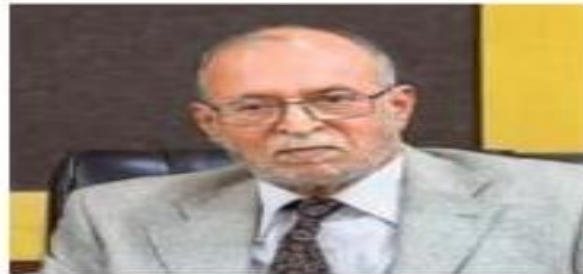
Anil Baijal •

Delhi has been given the go-ahead to use plasma enrichment technique on a trial basis to save the lives of critical COVID-19 patients, Lieutenant Governor Anil Baijal was told at a review meeting on Wednesday.