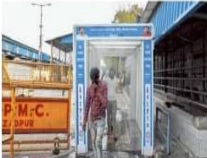
Tunnel vision: People passing through a sanitisation tunnel at Azadpur Mandi in New Delhi.