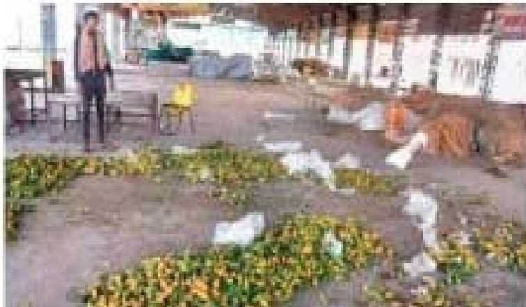
Morena: 1,500 persons

Fourteen days after he returned from Dubai, a 40-year-old man from Morena tested positive for COVID-19 along with his wife on Thursday. And a day later, 10 of his relatives who had taken part in a feast thrown by him tested positive too.