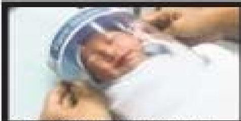
Acting early: A nurse adjusting a face shield to protect a newborn from COVID-19 at a hospital in Samut Prakan province, Thailand.

The number of confirmed COVID-19 cases in India crossed 4,000* on Sunday. While it took 55 days for 500 cases, it took only one day for it to jump from 3,500 to 4,000