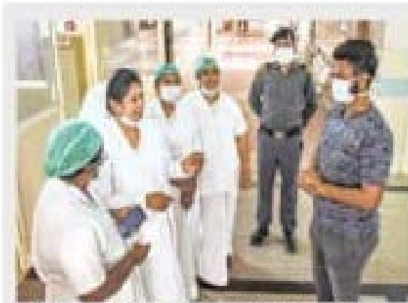
Celebrating their success: A patient who recovered interacting with staff at a hospital in Vijayawada on Saturday.