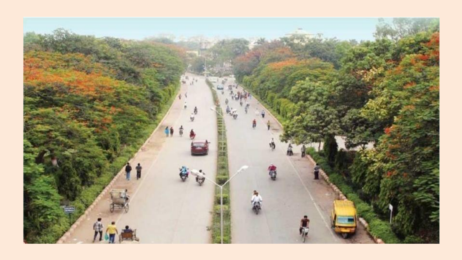
Ph.D. Information Bulletin 2024-25